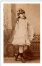
PC1 Taken in New York City