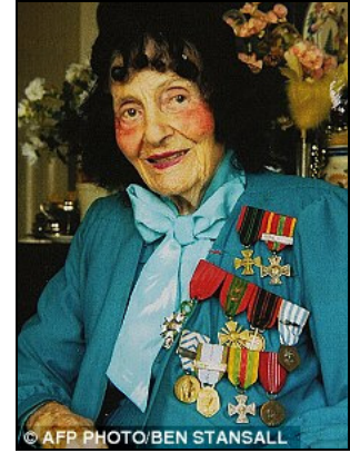
Notice the medals!